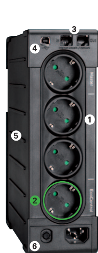
Eaton Ellipse PRO 650