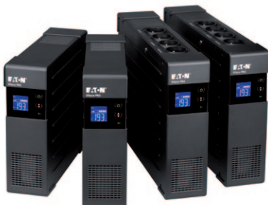
Ellipse Pro range