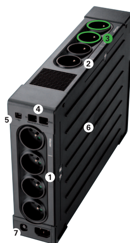
Eaton Ellipse PRO 1600