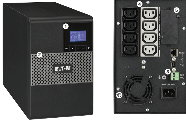
Eaton 5P 1550i UPS